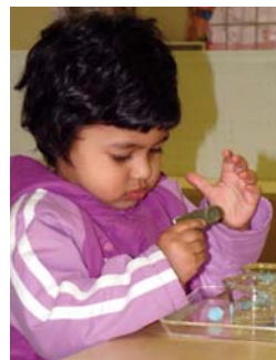
A toddler concentrates on a task that helps her develop fine motor skills.

The child's mind is like that of an acute observer, eager to learn, to explore, to try new skills and to master them through practice. At a very young age, the child is able to concentrate on a task, absorb sequences and procedures, and master new language and physical skills.