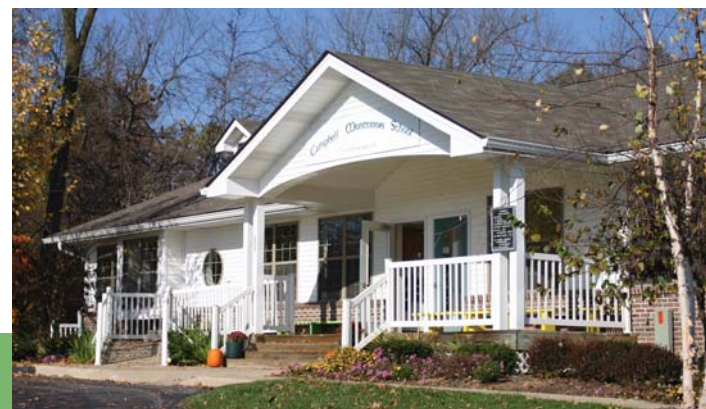
Our school, like most Montessori schools, is designed to look like a house.

Please call to schedule a personalized guided tour of our classrooms so you may witness the children at work—focusing, concentrating, and succeeding.