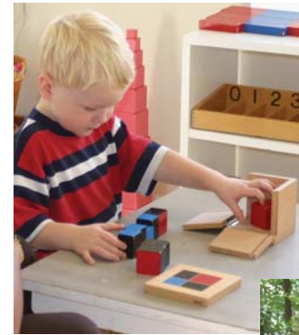
Above: A primary student builds a three-dimensional cube that will later demonstrate a mathematical concept.

Mathematics: Hands-on materials, such as number rods, bead bars, chains and cubes, and cutout numbers and counters, help the child to abstract mathematical concepts. Students feel, see and count these materials. Working with them builds a strong foundation for reasoning and problem solving as well as the mathematical concepts they demonstrate.