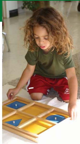
A young student works intently to match the shapes and sizes.