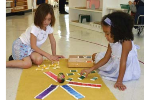
Primary students work together to arrange colors from lightest to darkest.

Elementary students work cooperatively on a science lesson, sharing information and reinforcing their knowledge.