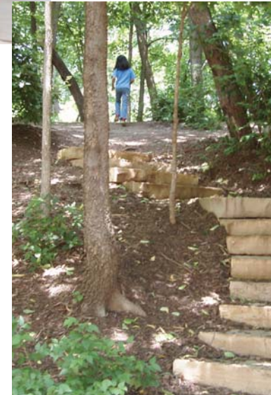
Right: Our back yard includes a playground and three acres of woods with trails for exploring.